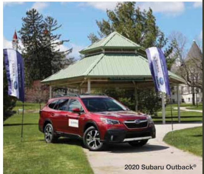
2020 Subaru Outback®

Honored to support Concerts on the Lawn and our Community.